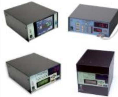
TOOL CONTROLLERS AND MONITORS