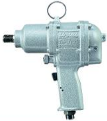
GENERAL ASSEMBLY AND FINISHING