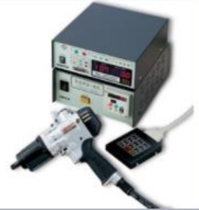
ELECTRIC PULSE TOOLS