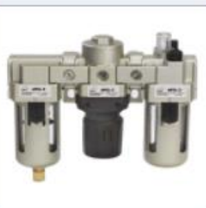
AIR PREPARATION UNITS