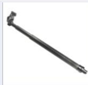
CARBON TORQUE ARMS & CARBON TORQUE TUBES