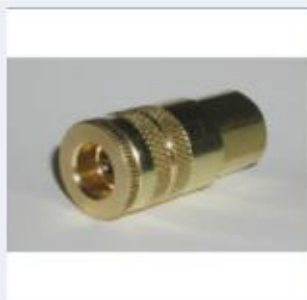
AIR LINE ACCESSORIES