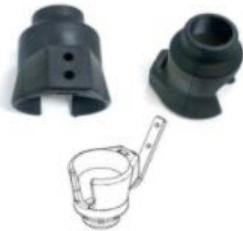
PULSE TOOL ACCESSORIES