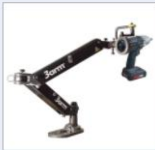
3ARM ZERO GRAVITY ARMS