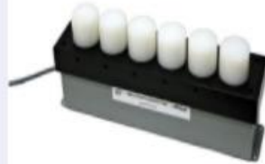
DC CONTROLLED ACCESSORIES