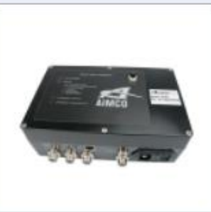
SMART TORQUE ARM ACCESSORIES