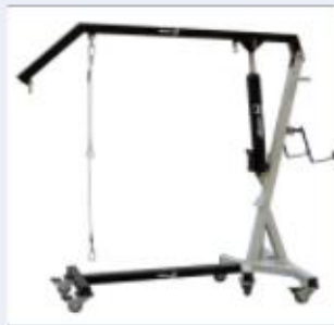
XDHT LIFT ASSIST