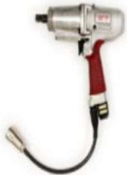
PNEUMATIC PULSE TOOLS