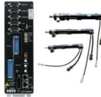
FIXTURED F-SERIES NUTRUNNER SYSTEM